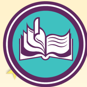
PROGRAM FOR CONTINUING EDUCATION