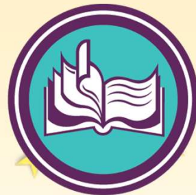
PROGRAM FOR CONTINUING EDUCATION