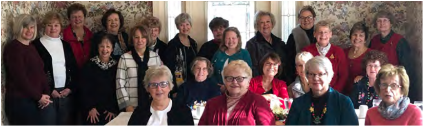
Chapter AW, 75 years