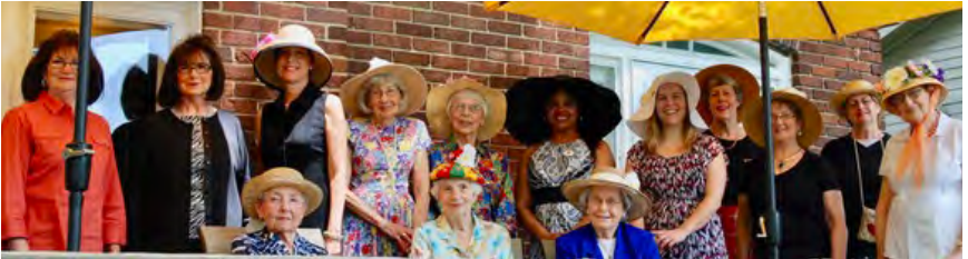
Chapter BA, 75 years