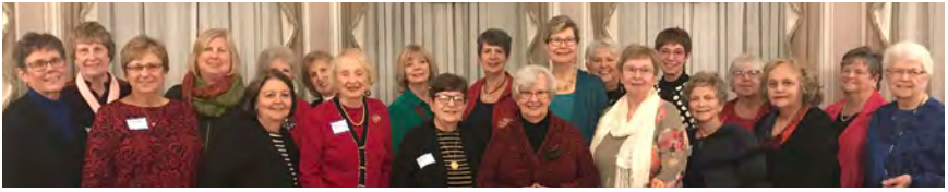
Chapter AY, 75 years