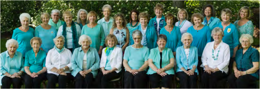
Chapter AZ, 75 years