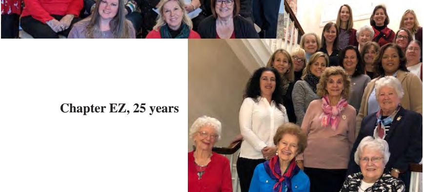
Chapter EZ, 25 years