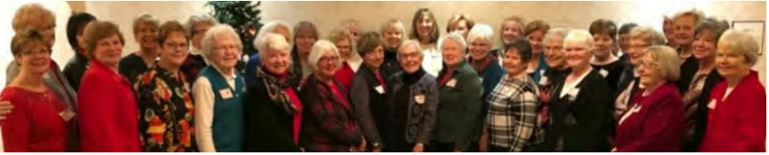
Chapter DU, 50 years