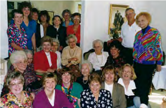
Chapter DX, 50 years