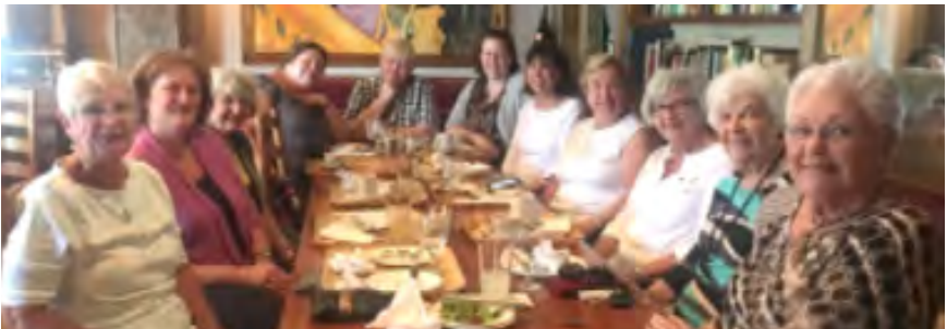
Chapter FA, 25 years