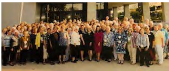
Ohio State Chapter Delegation

September 12-14, 2019 – Des Moines, Iowa