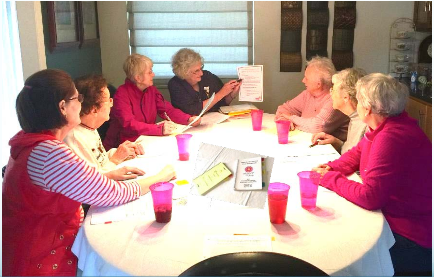
“Model” Chapter Officer Transition Meeting