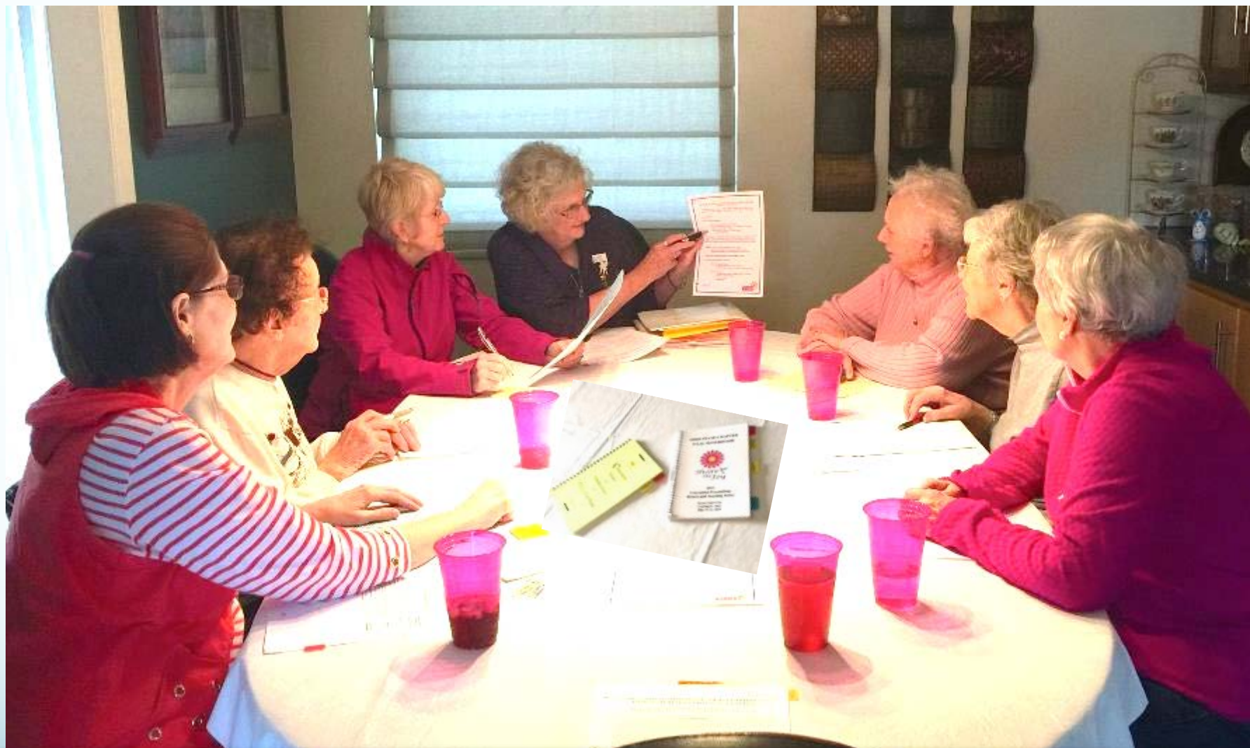
“Model” Chapter Officer Transition Meeting