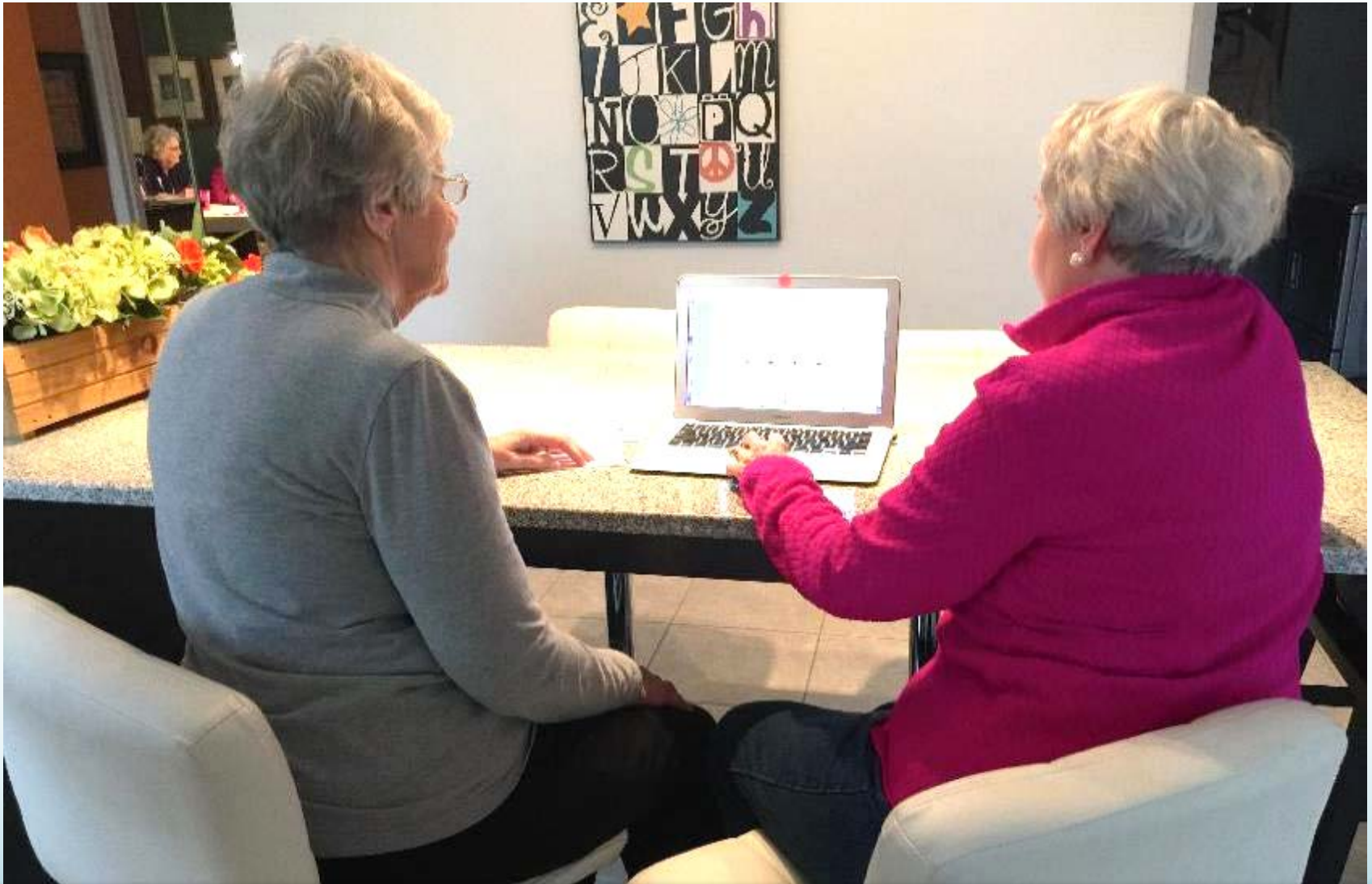
Individual officer training